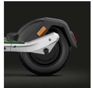
350W motor, Peak Power: 550W