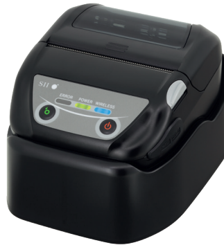
MP-B30 Cradle option